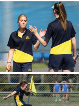
Senior A Grade Volleyball Zone Winners Senior A Grade Volleyball Finalist Intermediate A Grade Volleyball Zone Winners Intermediate A Grade Volleyball Finalist